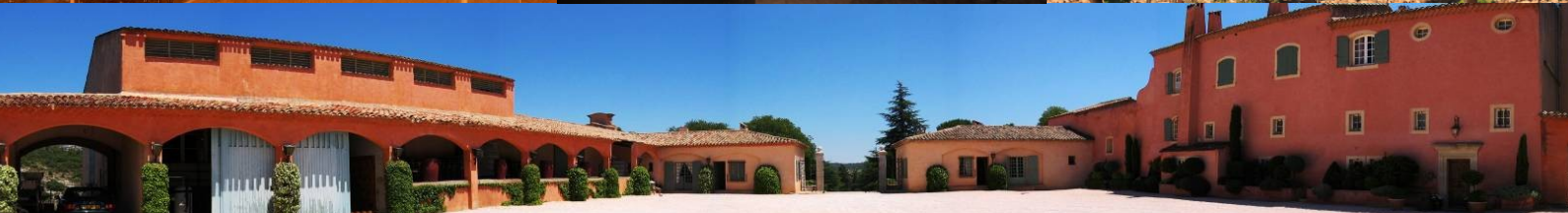
Route de Jouques - 83560 RIANS